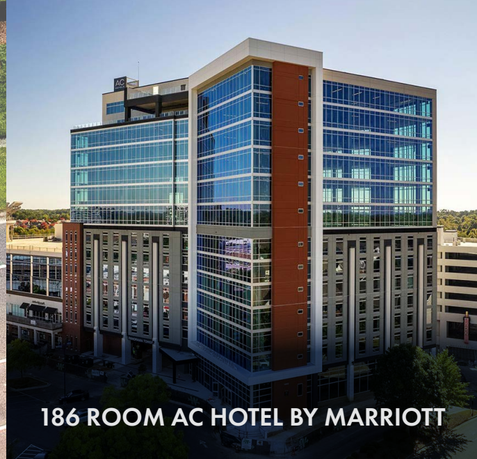
186 ROOM AC HOTEL BY MARRIOTT