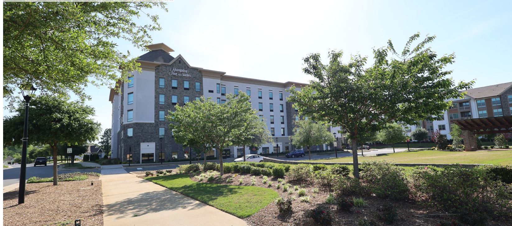
HAMPTON INN & SUITES