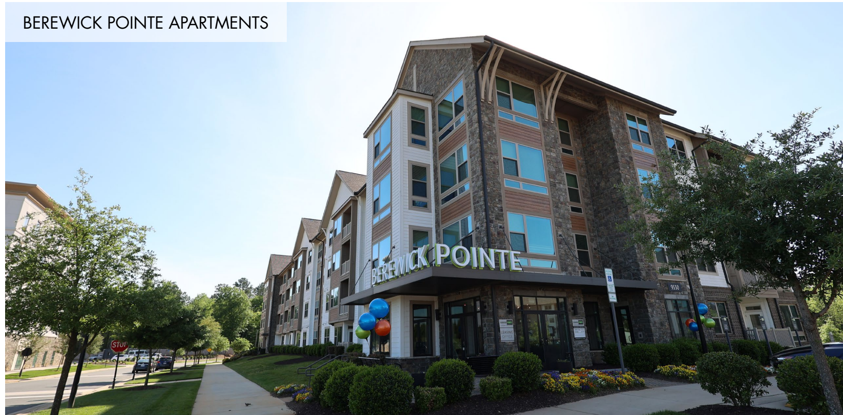
BEREWICK POINTE APARTMENTS