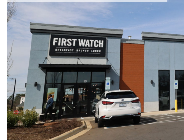
SHOPPES OF MADISON PLACE