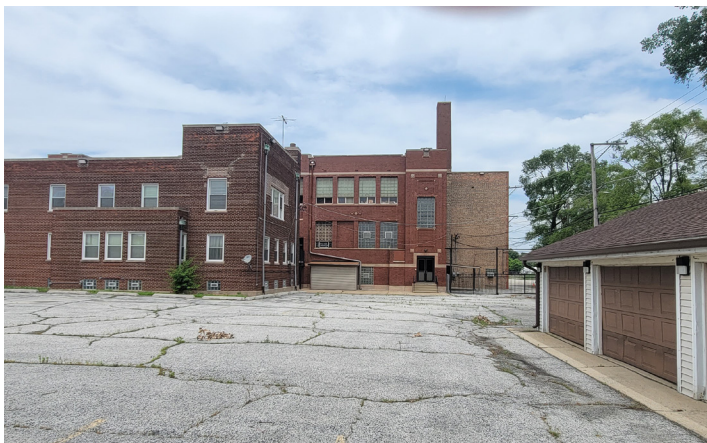
SIDE OF RECTORY BUILDING