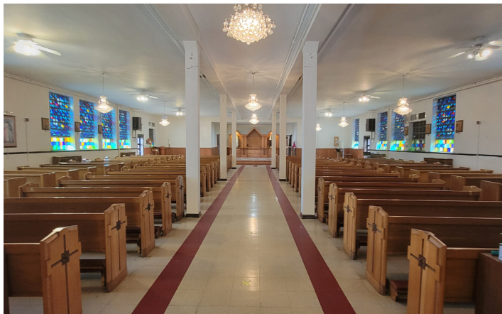
SANCTUARY FACING FRONT