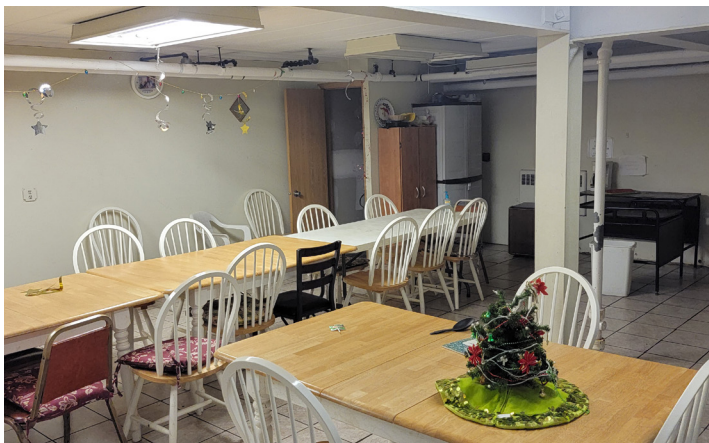
RECTORY MEETING ROOM