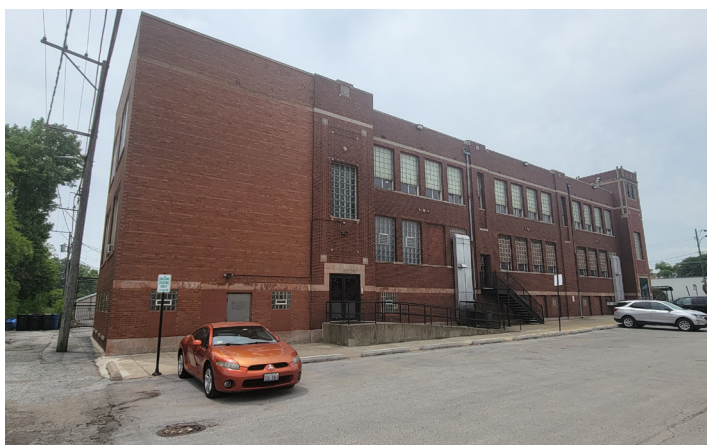
SIDE OF CHURCH BUILDING