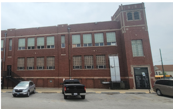
SIDE OF CHURCH BUILDING