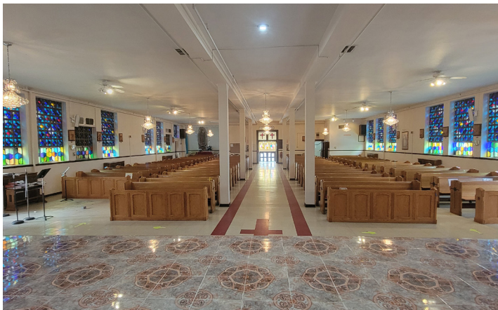
SANCTUARY FACING BACK