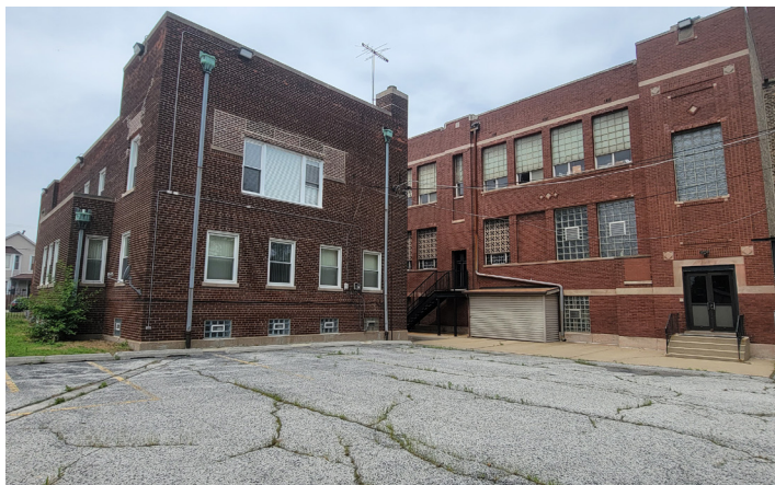
RECTORY BUILDING FROM THE PARKING LOT