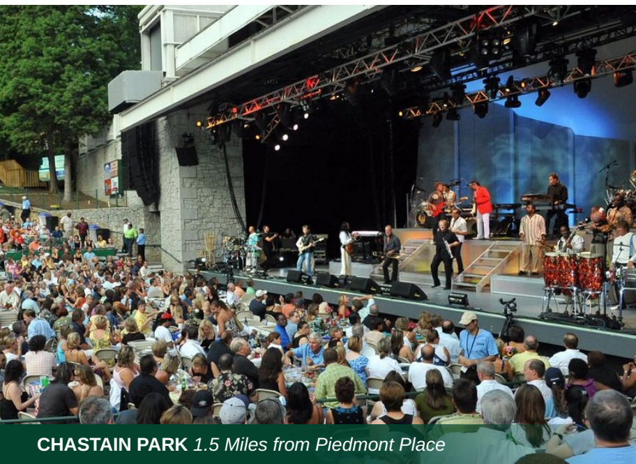
CHASTAIN PARK 1.5 Miles from Piedmont Place