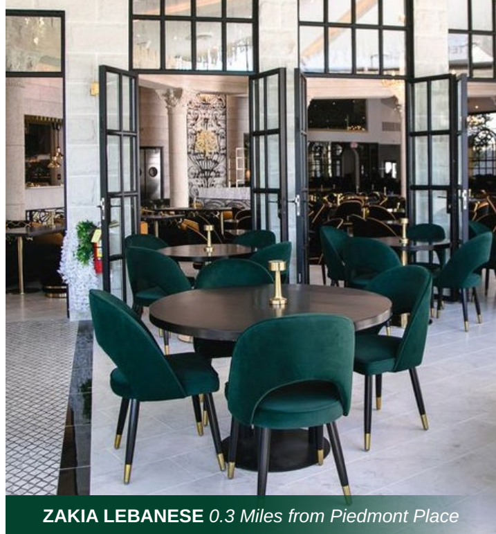
ZAKIA LEBANESE 0.3 Miles from Piedmont Place