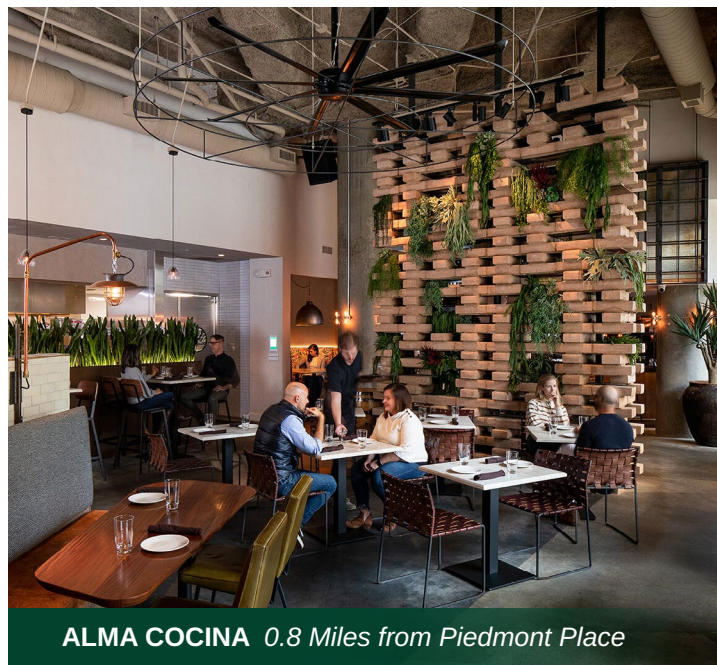
ALMA COCINA 0.8 Miles from Piedmont Place