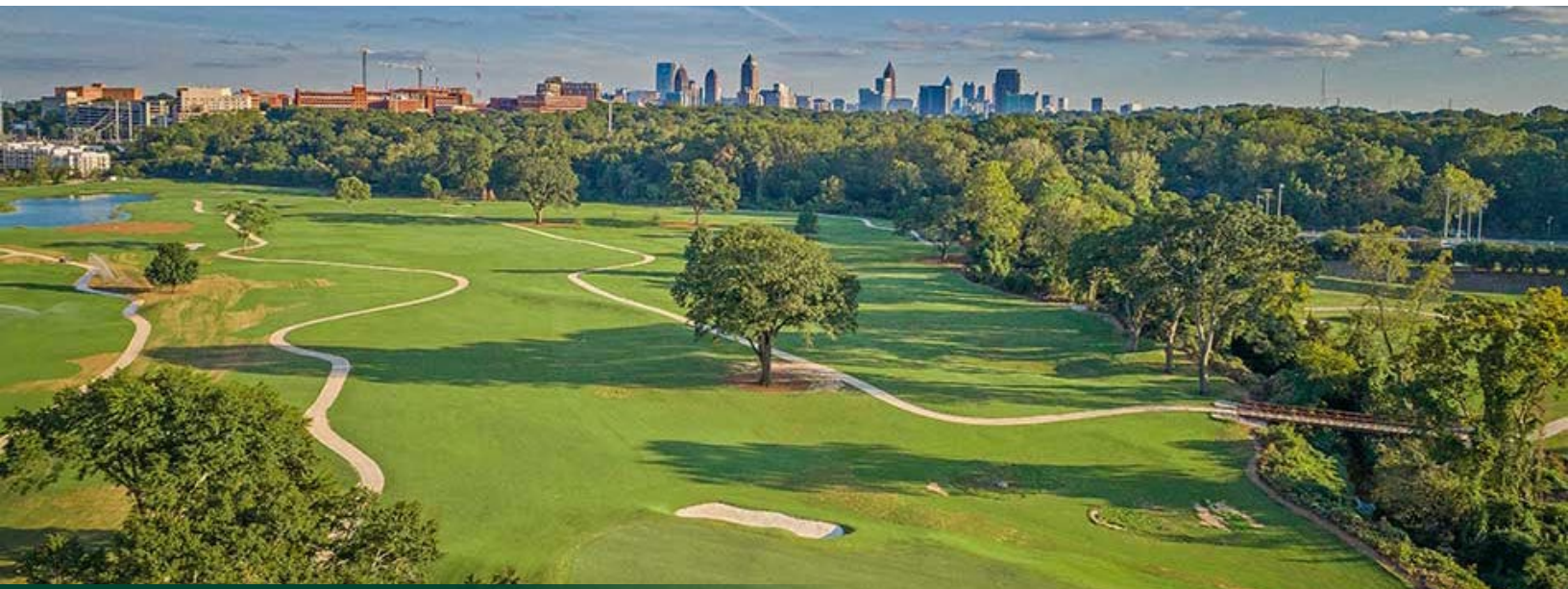
BOBBY JONES GOLF COURSE 3.8 Miles from Piedmont Place