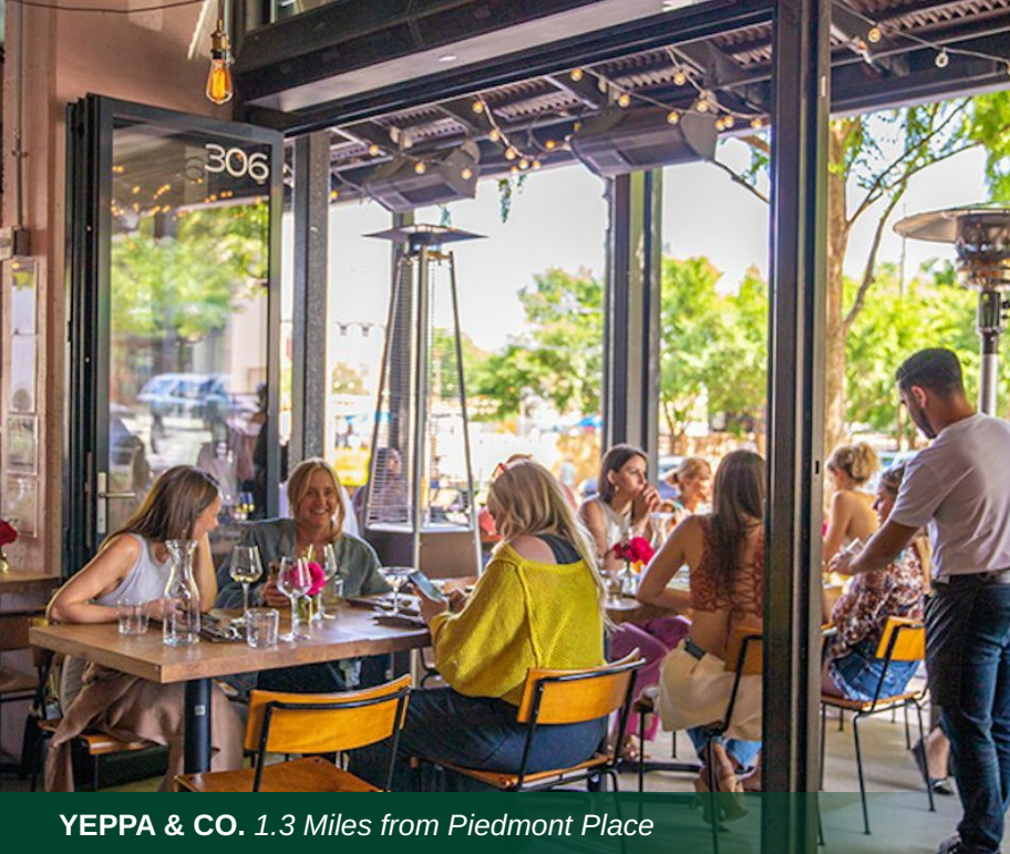
YEPPA & CO. 1.3 Miles from Piedmont Place