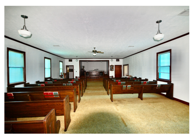
Sanctuary Facing Front