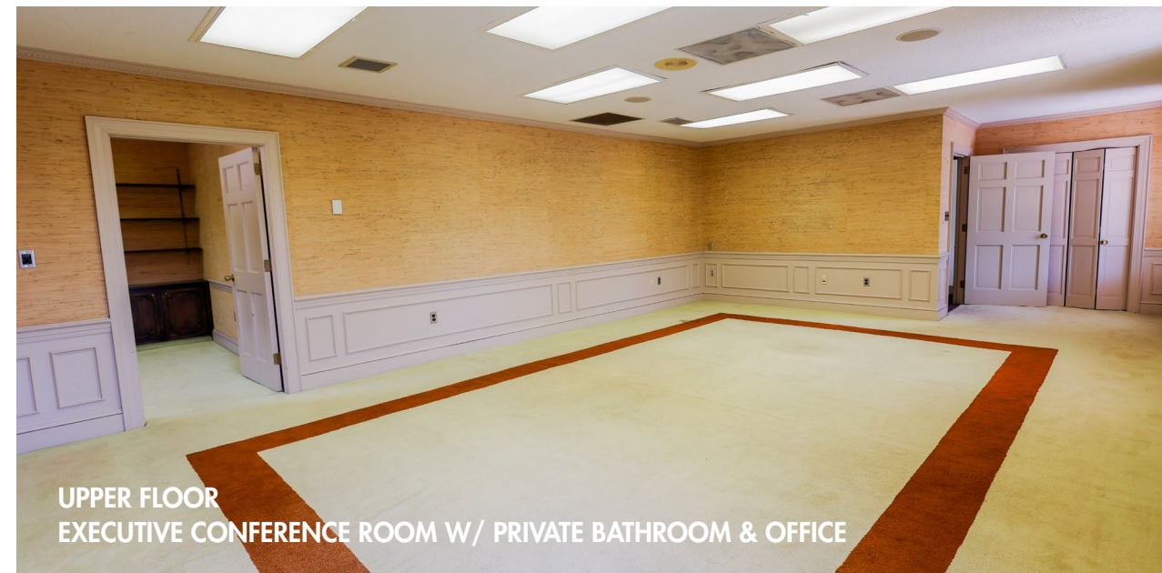
UPPER FLOOR EXECUTIVE CONFERENCE ROOM W/ PRIVATE BATHROOM & OFFICE