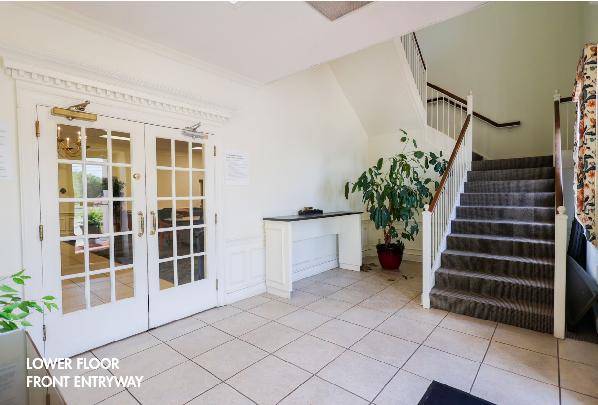
LOWER FLOOR FRONT ENTRYWAY