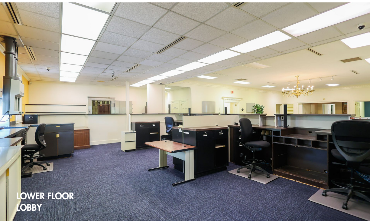
LOWER FLOOR LOBBY