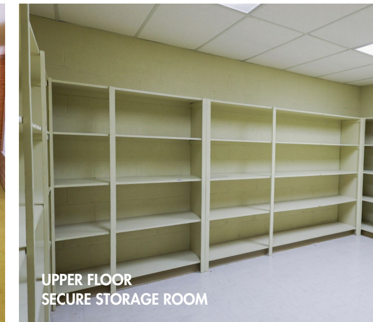
UPPER FLOOR SECURE STORAGE ROOM