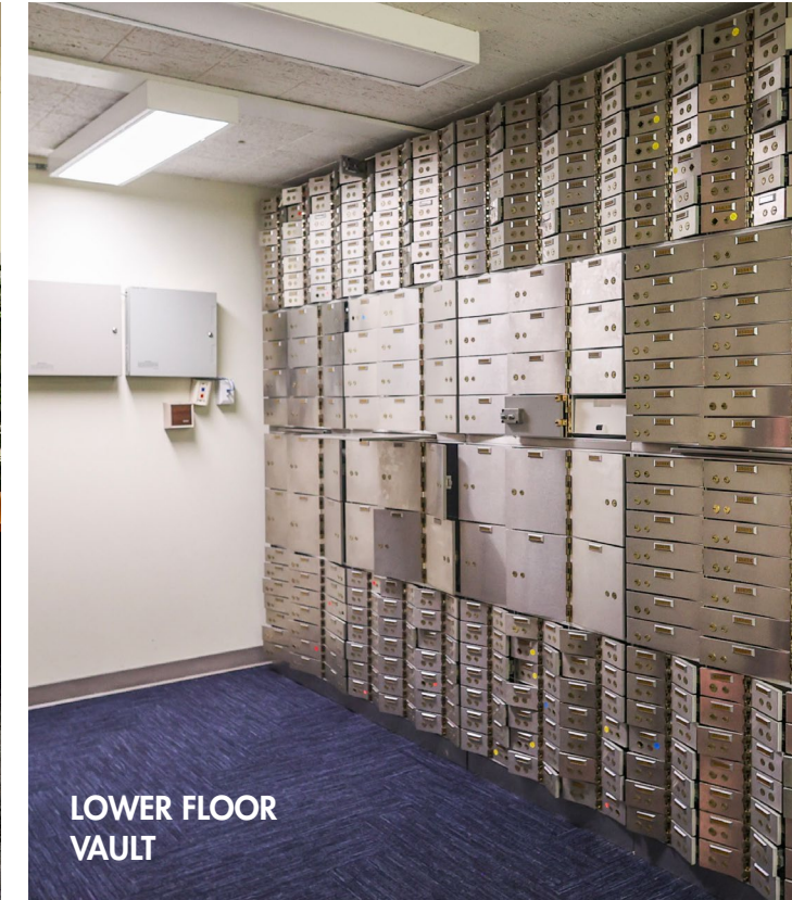
LOWER FLOOR VAULT