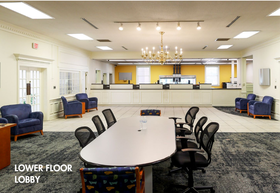
LOWER FLOOR LOBBY