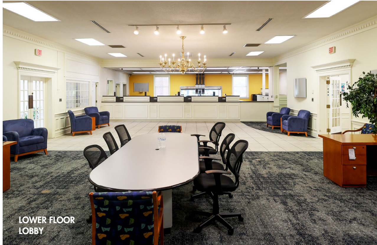
LOWER FLOOR LOBBY