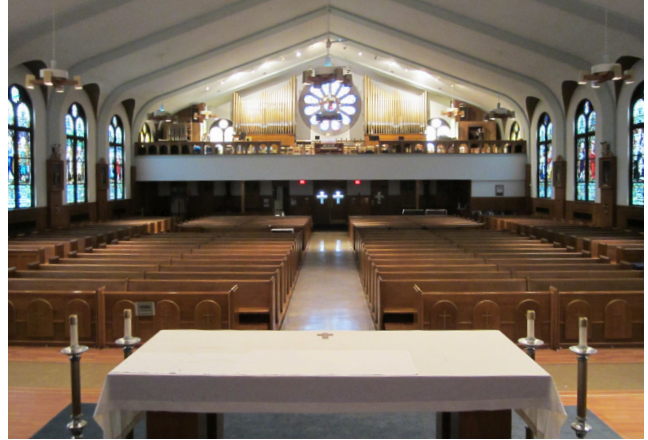
Sanctuary View from Stage