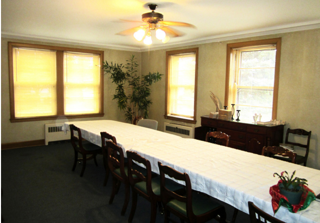
Rectory Dining Room