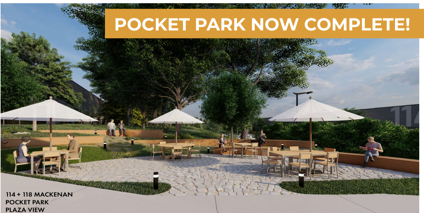
114 + 118 MACKENAN POCKET PARK PLAZA VIEW