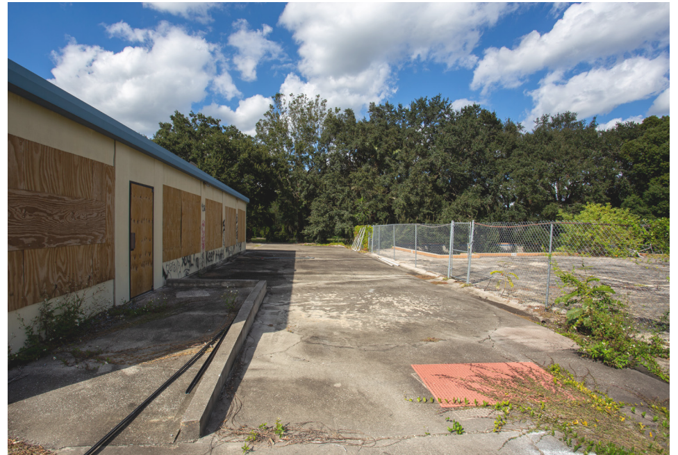
REDEVELOPMENT/MULTI-PURPOSE PROPERTY FOR SALE IN WINTER PARK, FL