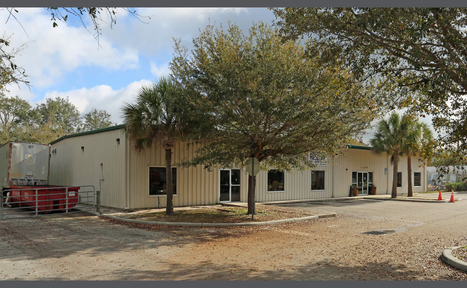
FULLY AIR CONDITIONED 8,400 SF WAREHOUSE